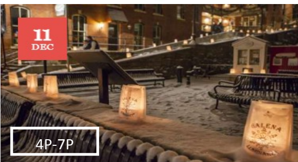
Night of the Luminaria and Living Windows