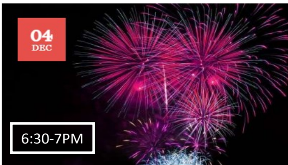
Holiday Fire In The Sky