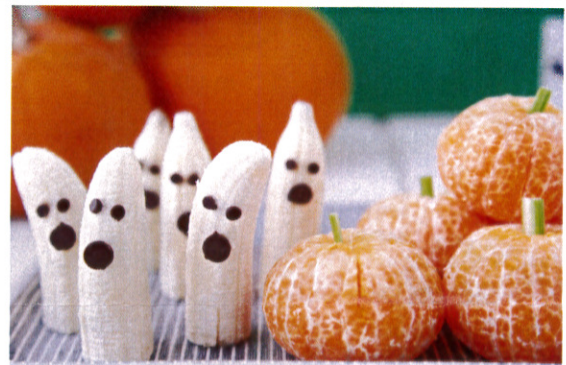
Banana Ghosts and Pumpkin Clementines, HOW CUTE!